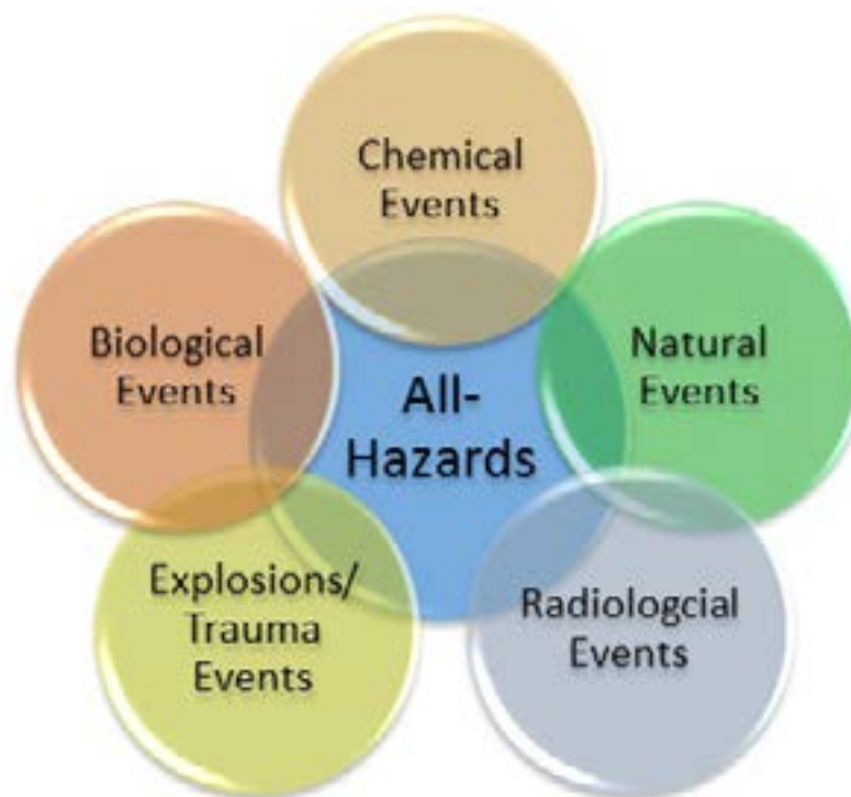
Figure 1: All-hazards approach maximizes available resources.

Peoples' Health Protected—Public Health Secured