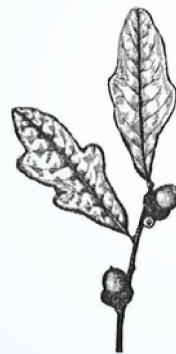
White Shin Oak Quercus breviloba