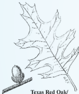
Texas Red Oak/ Spanish Oak Quercus buckeyi