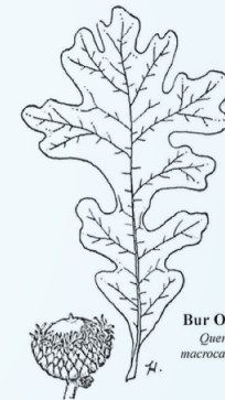
Bur Oak Quercus macrocarpa