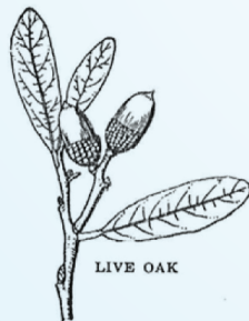
Plateau Live Oak Quercus fusiformis

(Live oaks are susceptible to oak wilt but do not form fungal mats.)