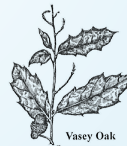
Vasey Oak Quercus pungens var. vaseyana (western Edwards Plateau)