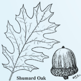
Shumard Oak Quercus shumardii (East Texas native)