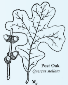
Post Oak Quercus stellata