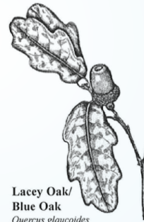
Lacey Oak/ Blue Oak Quercus glaucoides