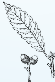
Chinkapin Oak Quercus muehlenbergii